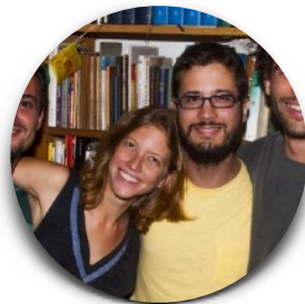
Opavivará ! Colectivo Brazil