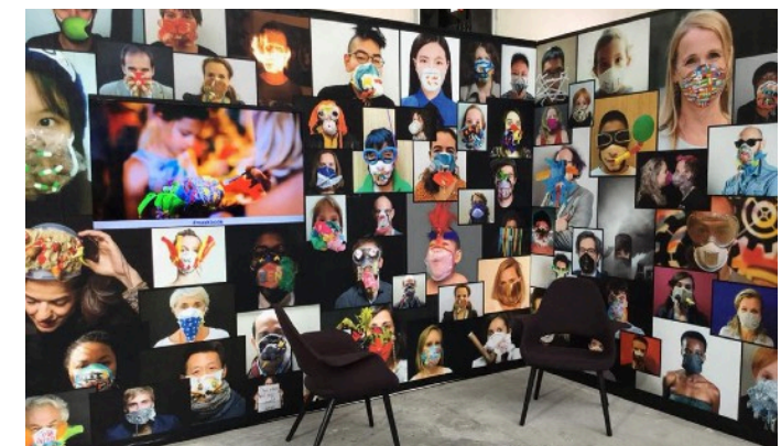
Exhibition at the Grand Palais in Paris during COP21