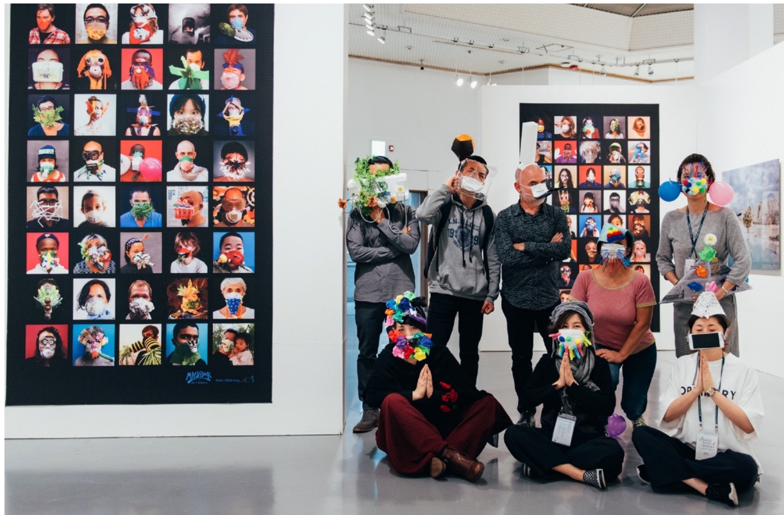
Maskbook's exhibition at the Daegu Photo Biennale

The first exhibitions took place in 2015 for COP21, with three simultaneous exhibitions at the Grand Palais in Paris, at the Institut Français of Beijing and in the heart of COP21 civil society Green Zone at Le Bourget . Maskbook is also regularly selected by curators from around the world, such as was the case in 2016 for the Daegu Photo Biennale in South Korea, the Angkor Photo Festival in Cambodia and at Hong Kong art gallery La Galerie's exhibition organized by GreenPeace East Asia, in which Sigourney Weaver was in attendance!