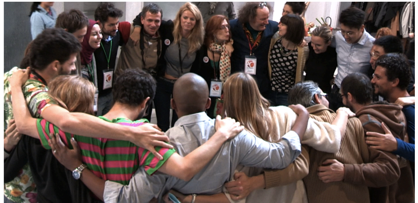
Les « 21 » à la Gaîté Lyrique lors de la clôture des débats

Modèle économique: Private and public support. Art of Change 21 financed the attendance of all participants (travel, lodging, visas, other expenses...).