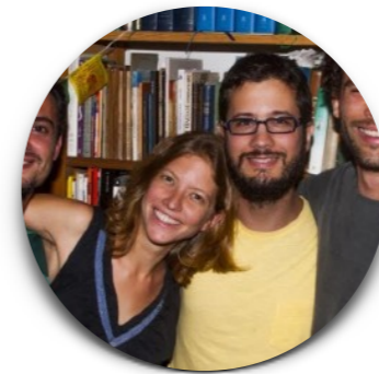
Opavivará ! Colectivo Brazil