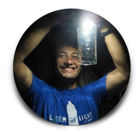
Illac Diaz Philippines

Visual artist - Exhibited at the Tate (London), MUAC UNAM (Mexico City), Guggenheim (New York), Centre Georges Pompidou, Palais de Tokyo (Paris) @micadust