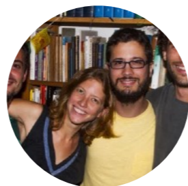
Opavivará ! Colectivo Brazil