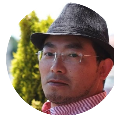
Vincent JF Huang Taiwan

Visual artist - Exhibited at the Tate (London), MUAC UNAM (Mexico City), Guggenheim (New York), Centre Georges Pompidou, Palais de Tokyo (Paris) @micadust