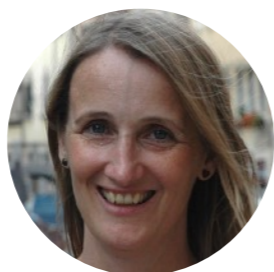
Lucy Orta UK