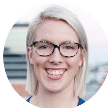
Edda Hamar Island - Australia

Founder of MyShelter Foundation and Liter of Light @illacdiaz @literoflight