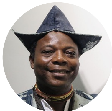
Romuald Hazoumé Benin

Visual artist - Exhibited at the British Museum (London), Guggenheim (Bilbao), Centre Georges Pompidou (Paris), ICP (New York)