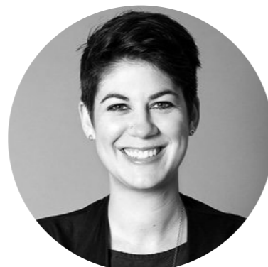
Leyla Acaroglu USA

Visual artist - Exhibited at the British Museum (London), Guggenheim (Bilbao), Centre Georges Pompidou (Paris), ICP (New York)