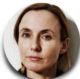
Nathalie Jeremijenko USA