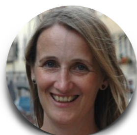
Lucy Orta UK