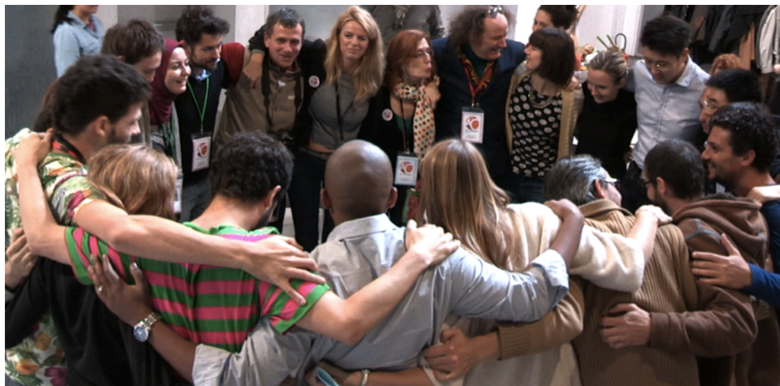
The « 21 » at the Gaîté Lyrique at the end of the second day.

Over two days, the Conclave will consist of a lively program of co-creativity and brainstorming, and will be hosted by professionals in collaboration and collective creation.