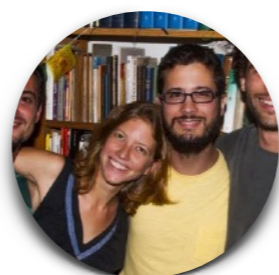
Opavivará ! Colectivo Brazil