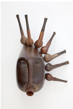
Romuald Hazoumé, La Sultane , 2016, Collection Longchamp, Courtesy of the artist