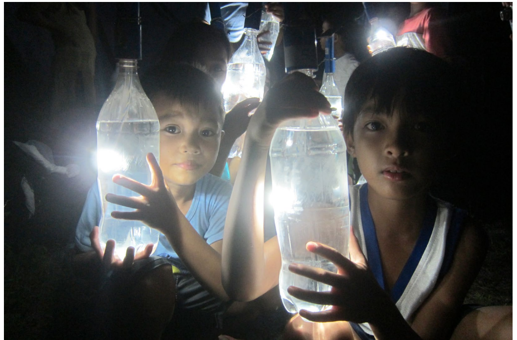
Liter of light