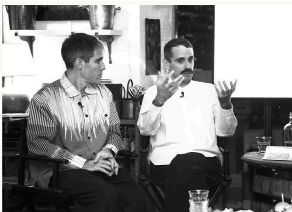
Cooking Sections at Hauser & Wirth's west London farm shop earlier this week