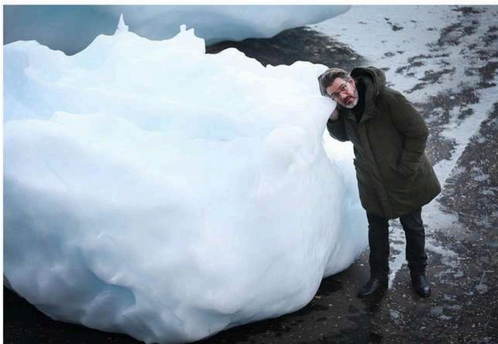
Olafur Eliasson, Ice Watch, 2018.