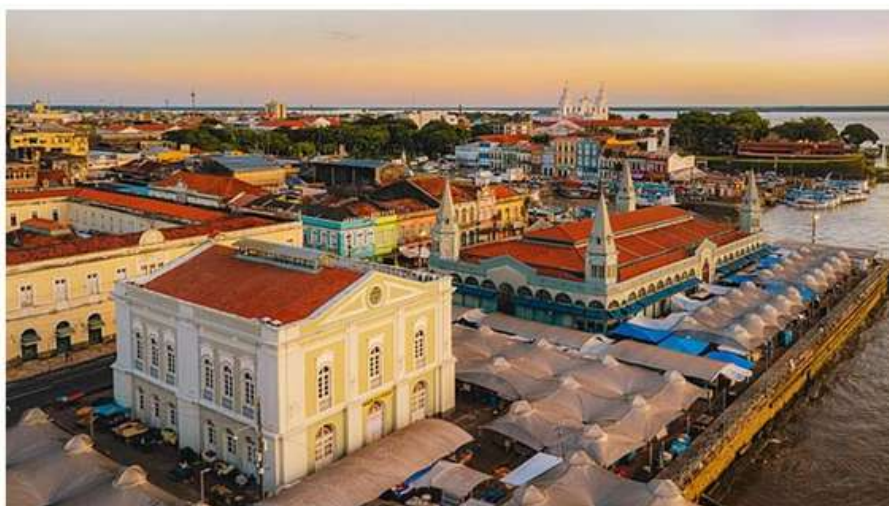
Vue panoramique du centre historique de Belém, 2023.

United Artists for Climate, une délégation représentant des artistes contemporains et le monde de la culture, est présente à la COP30, qui se tient du 10 au 21 novembre 2025 à Belém, au Brésil.